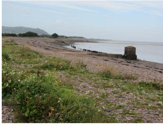
A view towards Minehead

When the other members arrived we took them on a local walk around Dunster before a cuppa