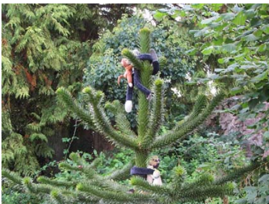
The monkey puzzle tree at Carhampton

Three of us headed out once again through the deer park and over Gallox Bridge to follow the Bat's Castle walk in an attempt to find the ponies for Mel. We walked across from Bat's Castle and down Park Lane heading towards Carhampton and the A39. At Carhampton we passed the monkey puzzle tree with toy monkeys climbing on it and took time to look in the reclamation yard. We walked along the A39 to the recreational park where we walked around the cricket pitch to pick up the path through the fields and then over the footbridge at the railway line and on to Blue Anchor. We had refreshment at the Driftwood Café at Blue Anchor then back along the new path to Dunster Beach and Dunster 7.5 miles