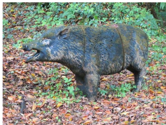
A boar sculpture at Clicket