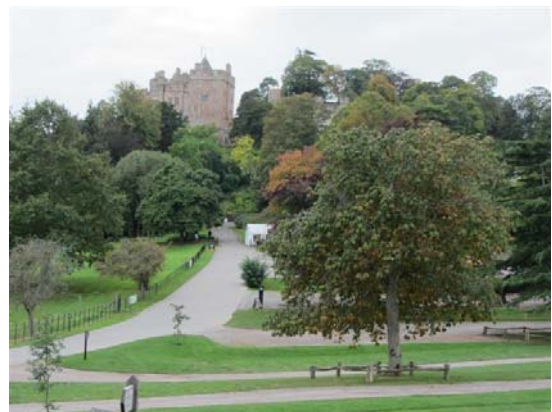
A view of Dunster Castle