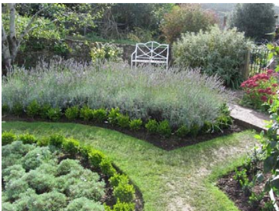
The walled garden