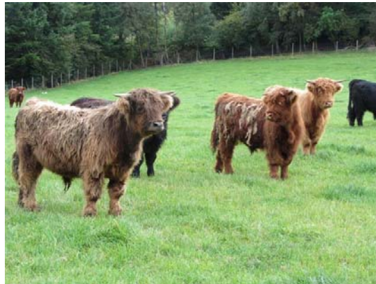
These young Highland Cattle looked so cute