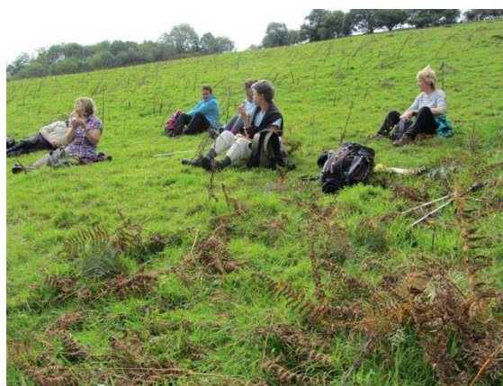
A leisurely lunch looking into the valley