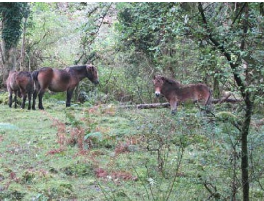
Ponies in the woods near Horner