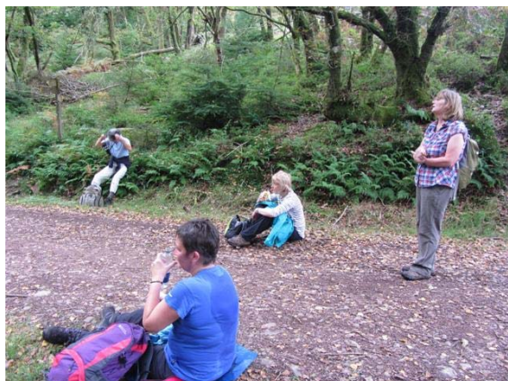
A well deserved coffee break after our long climb