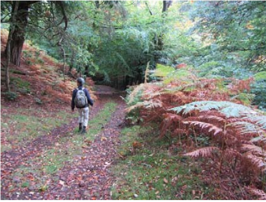
Walking through the woods from Webber's Post