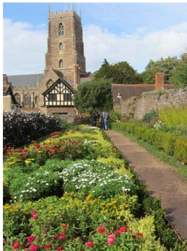
A view of Dunster Church from the walled garden

When the other members arrived we took them on a local walk around Dunster before a cuppa