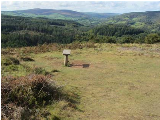
The view from Bat's Castle towards Dunkery Beacon

Jo and I walked through the Deer Park, over Gallox Bridge and on towards Bat's Castle. We took the alternative Boniton Path to Bat's Castle then back to Dunster 5 miles.