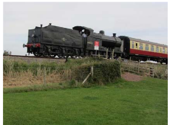
West Somerset Railway