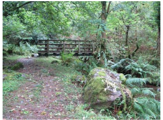
We crossed several bridges over the river