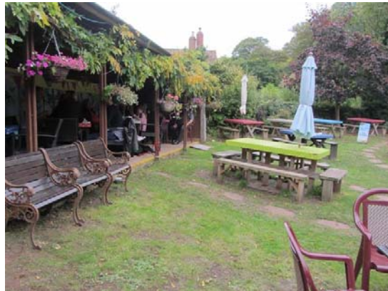
Horner Tea Rooms

This was a really good weekend with several good and challenging walks. Let us hope the weather is kind to us again when we meet in November. I am hoping for some lovely autumn colours.