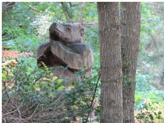
The bear near Vinegar Hill Viewpoint

Animal sculptures have been placed in the woods to add to the atmosphere. Our enjoyable walk continued and we made our way to Timberscombe and through the fields and woods to meet up again at the Long Combe track we had used earlier. On up towards Withycombe Gate and over Bat's Castle and a walk back into Dunster. 12.5 miles