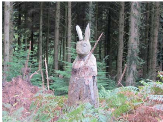
A carved hare at the top of Long Combe