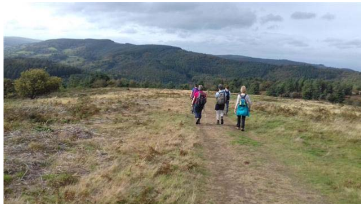
Walking back to Dunster with Grabbist Hill in view