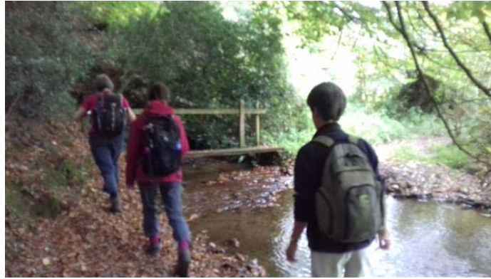
Making our way towards Croydon Hill