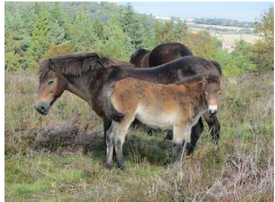
We met ponies and foals near Bat's Castle